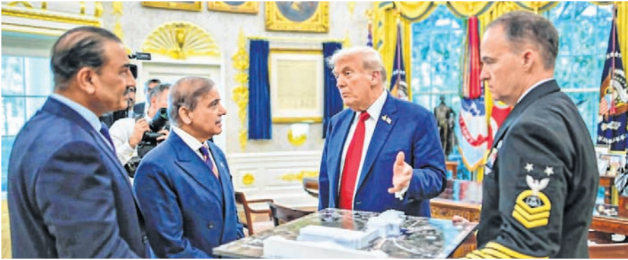
US President Donald Trump with Pakistan Prime Minister Shehbaz Sharif and Field Marshal Asim Munir at the White House in Washington on Friday